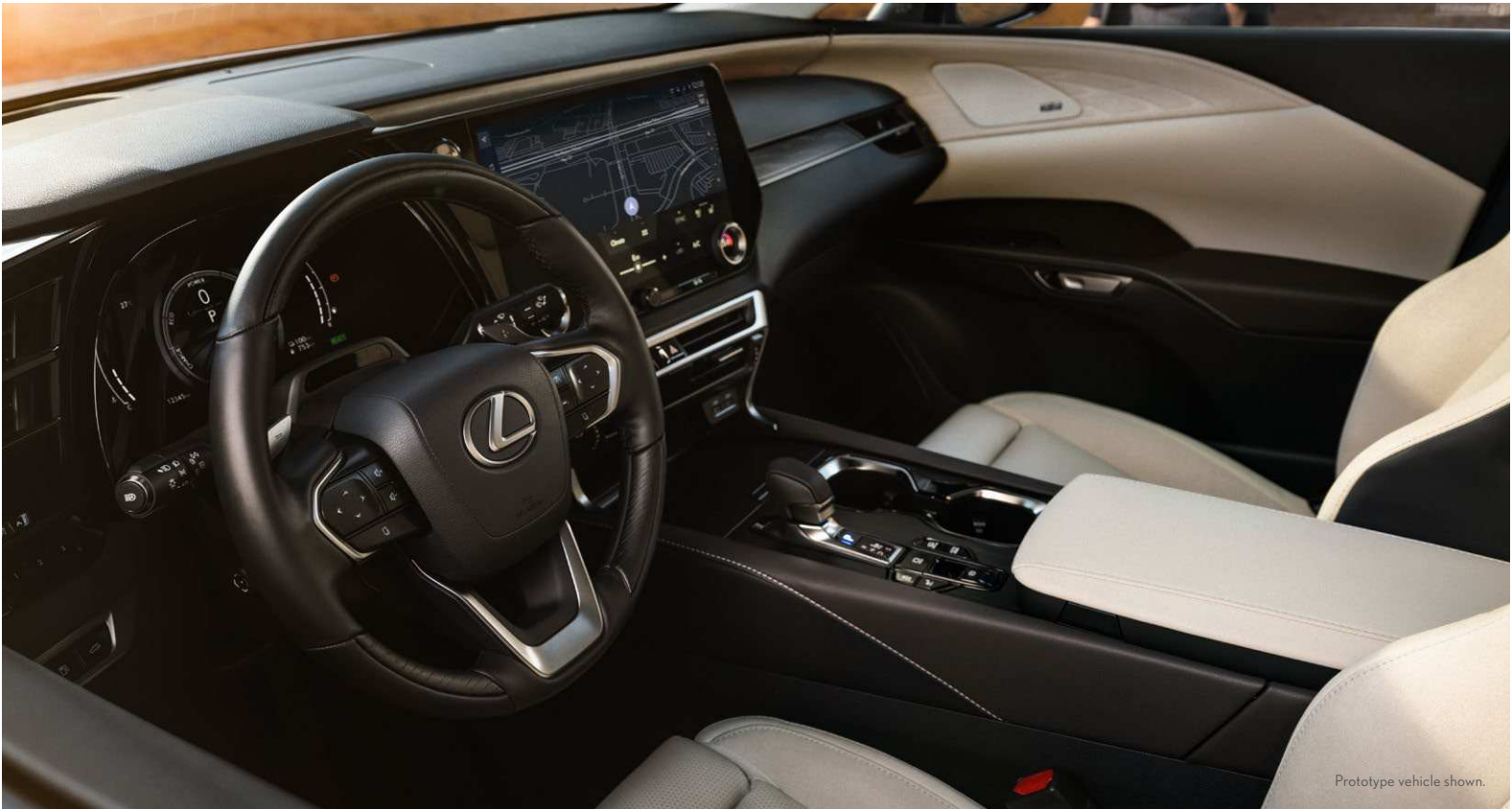
Prototype vehicle shown.